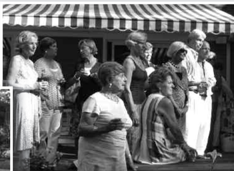
Enjoying a beautiful evening at the Cleggs